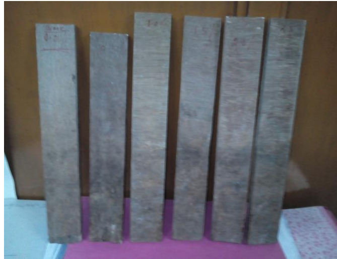
Fig 1 : Samples after exposure to termite test