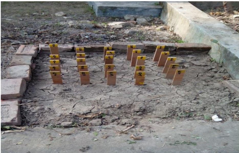
Sample exposed in graveyard test

The graveyard test was carried out according to EN 252 (1990). The stakes (25 mm x 50 mm x500 mm) were buried half to their length (Image- 1). The stakes were put in rows with a distance of approximately 300 mm and the different materials were installed alternately. All specimens were free of cracks, decay and other obvious defects.