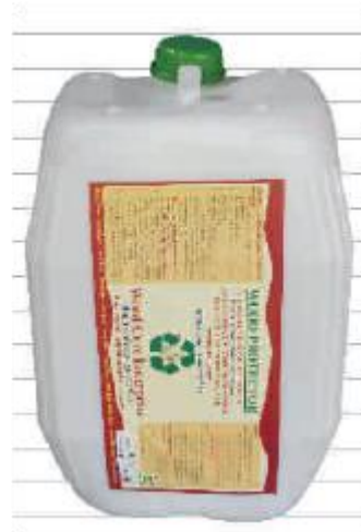
PACKING OF WOOD PROTECTOR SCAPO ™